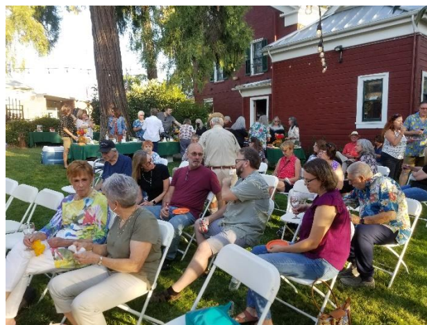
ACHS members and guests gather on the museum lawn during the September 17 th Wine and Cheese Tasting event.