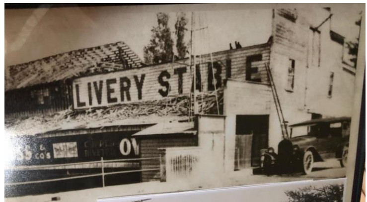
Livery stable photo from April 8, 1928 taken during destruction.