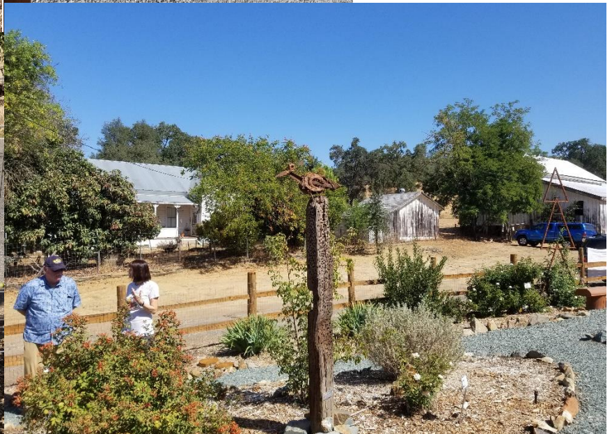
(Left) White rose, "Mlle de Sombreuil" (1850) is scented and a repeat bloomer. Heritage rose stock must be at least 100 years old. (Right) Jeffrey Powell enjoys a garden tour from Heritage Garden volunteer Susan Price .