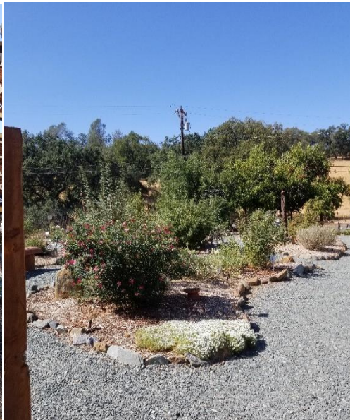
(Left) A sign welcomes visitors to the UCCE Master Gardeners' Rose Garden on Jackson Gate Road. (Right) Fall blooms greet visitors along the garden's paths.