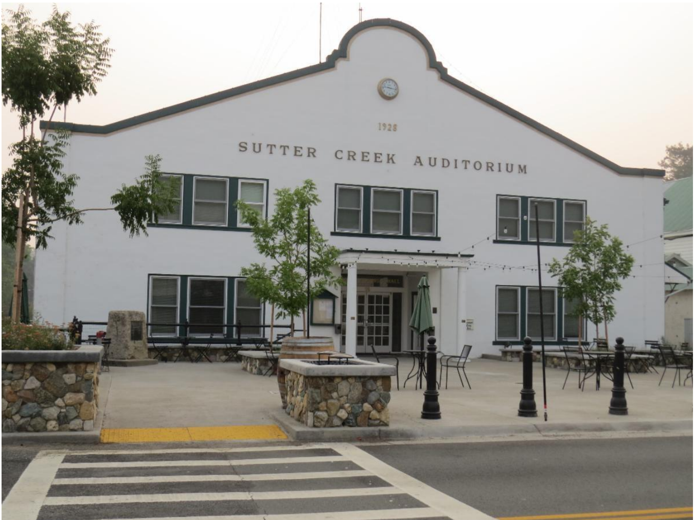
The Sutter Creek Auditorium today