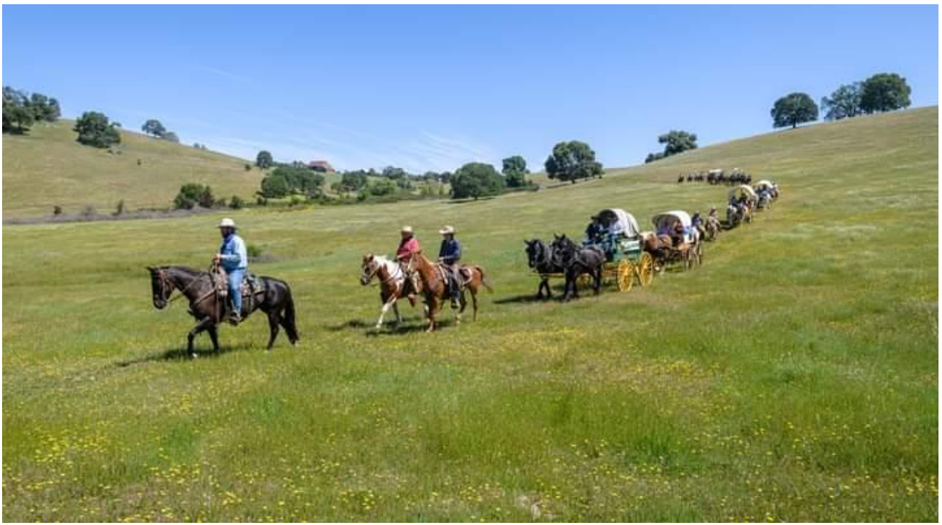
The Kit Carson Mountain Men are excited to bring the Wagon Train to Amador County again and revive the Kiddie's Parade.