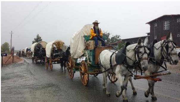
A wagon sponsored by the City of Sutter Creek rolls in the Days of Kit Carson Wagon Train (date unknown).