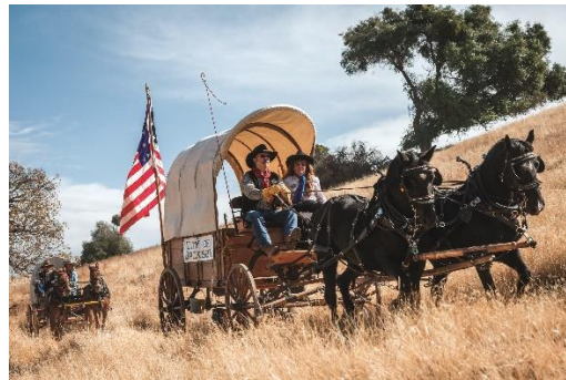
The City of Jackson sponsored wagon is part of the 2014 wagon train organized by the Kit Carson Mountain Men.