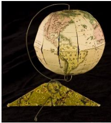
Townsend's Folding Globe from the collection at the Norman B. Leventhal Map & Education Center, Boston Public Library.