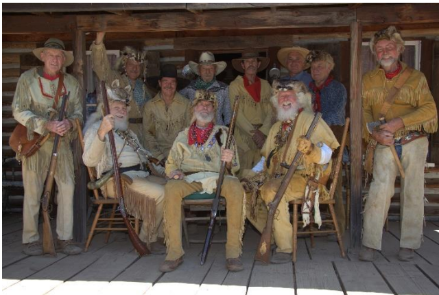
Kit Carson Mountain Men gather at their cabin located on Jackson Gate Road, Jackson.

Here is a little history of the Kit Carson Mountain Men who are the organizers of the Wagon Train and responsible for bringing back the Kiddie's Parade: