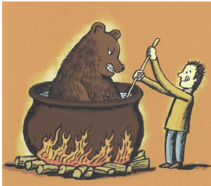
1852 holiday repast, a succulent, local grizzly bear

There was one other celebration that long ago Fourth. At Spruce Gulch, wherever that was, the miners there celebrated the Fourth by roasting whole for their holiday repast, a succulent grizzly bear.