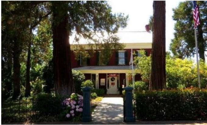
The Amador County Museum, 225 Court Street in Jackson, California

When was the last time you visited the Amador County Museum? It is jam packed with historical information and relics of days gone past. If you haven't visited it in a while, you should take the time for a trip.