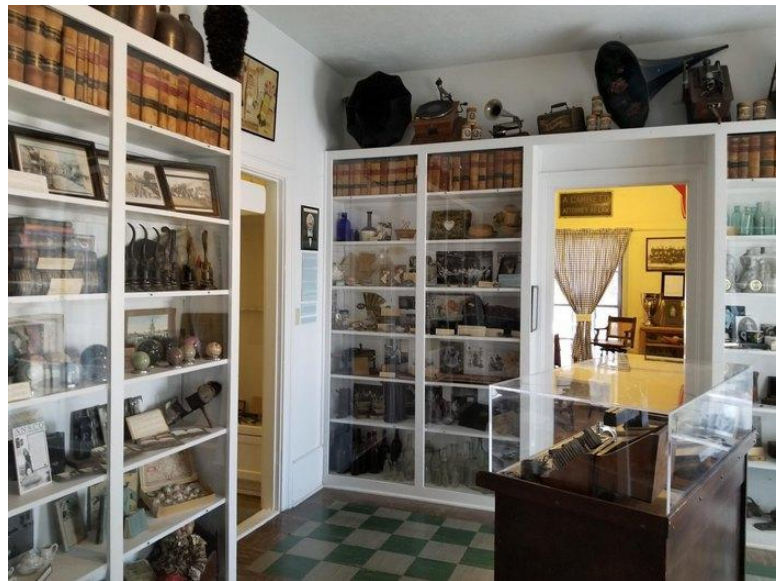
An ever-expanding display of artifacts is on display at the county museum.