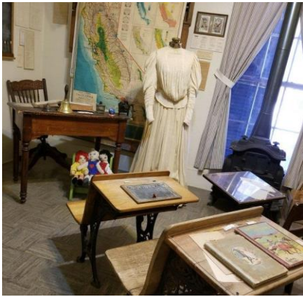
On display at the museum is a school room from the 1850s.

Through collaborations with local historical societies, the museum constantly expands its collection, acquiring valuable artifacts and documents that shed light on the region’s past.